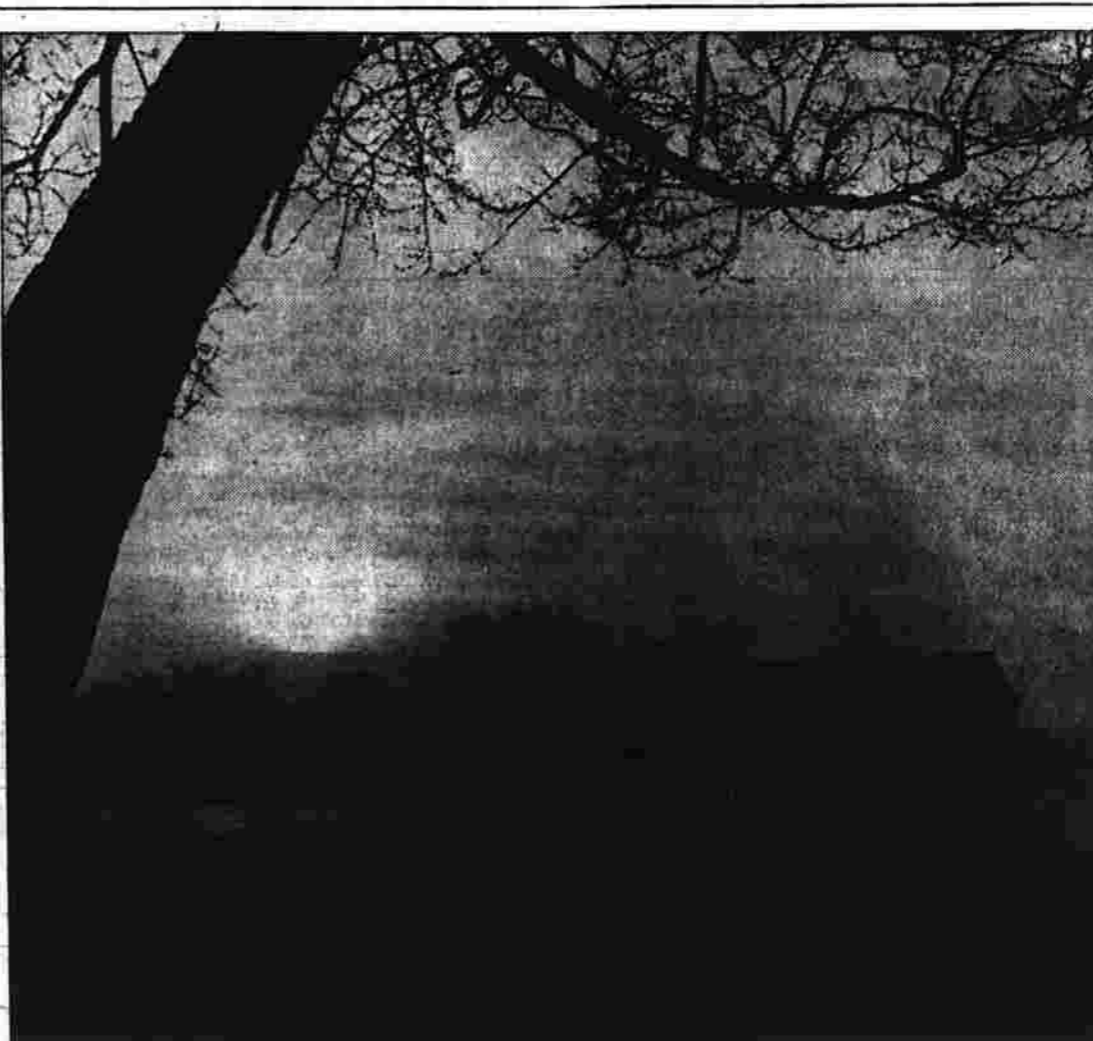
Start of Another Mild Day At 7:30 this morning, Herald photographer Joseph Sateris took this picture of an early sun dispersing haze to bring forth a snow-covered field, a Toland Tpke. tobacco barn, and the start of another cloudy and rainy winter day in Manchester. Along with most of the nation, the town enjoyed the mild weather following the frigid winds and temperatures that ushered in the month.